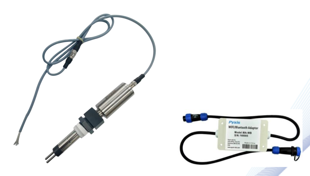
CR-300 (24 VDC Powered and 4-20mA Output w/Wireless Adapter for Configuration)