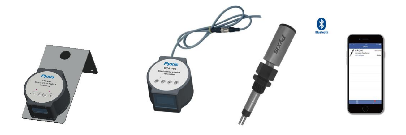
CR-200 (Bluetooth Enabled & Connection Options)